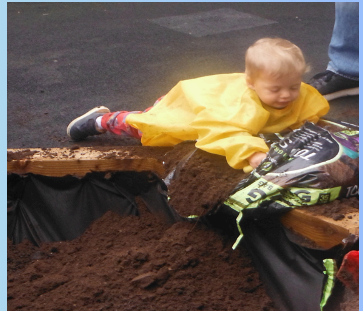
Enjoying planting at Little Gardeners session

Fawood Nursery School and Family Wellbeing Centre 35 Fawood Avenue NW10 8DX 02089659334